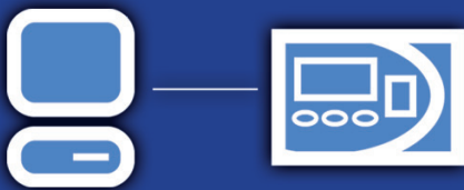
Serial Connection Connect directly to PC